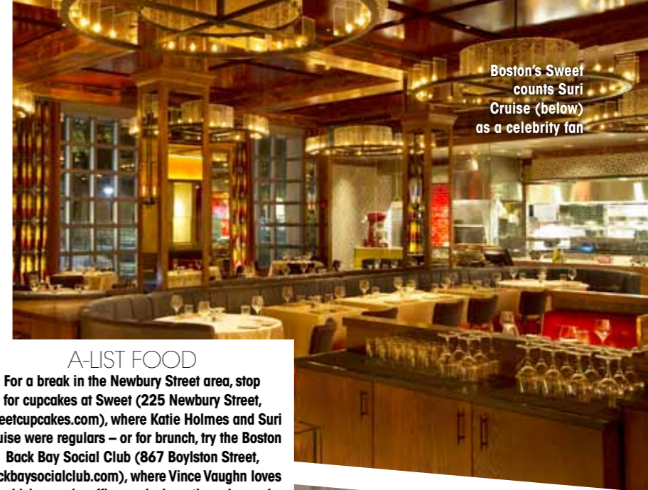
Boston's Sweet counts Suri Cruise (below) as a celebrity fan