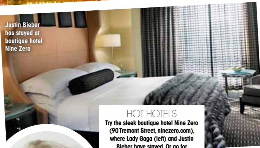
Justin Bieber has stayed at boutique hotel Nine Zero